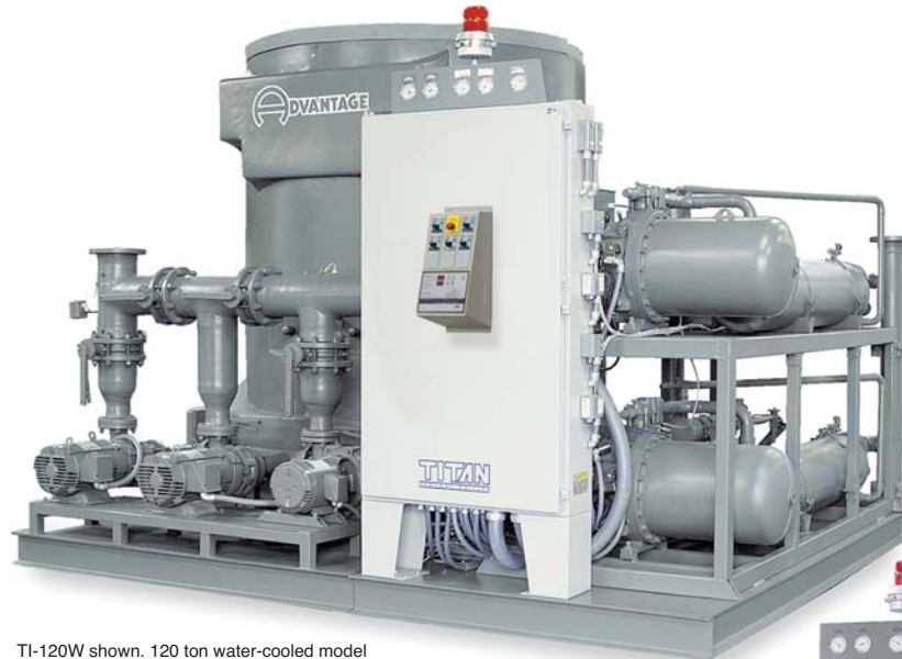
TI-120W shown. 120 ton water-cooled model with optional standby pump and manifold.