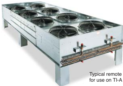
Typical remote air-cooled condenser for use on TI-A models.