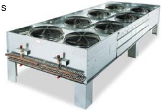
Remote Air-cooled condenser

Titan® central chillers are offered with Air-Cooled or Water-Cooled condensers. The selection is influenced by the industrial environment where the Titan® will be installed including available condensing water supply and plant ambient temperatures. The condenser is a heat exchanger where the heat absorbed by the refrigerant during the evaporating process is given off to the condensing medium. As heat is given off by the high temperature, high pressure refrigerant vapor, its temperature falls and the vapor condenses to a liquid.