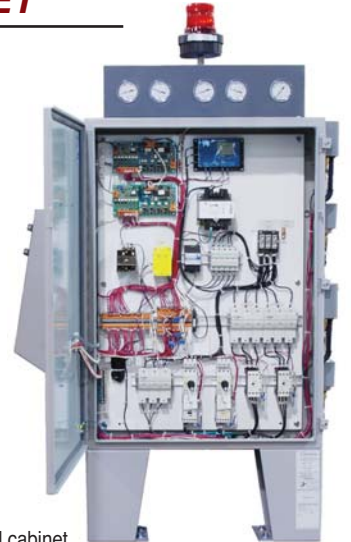
Titan electrical cabinet

* Water condensed only. Air condensed remote condensers require separate power.