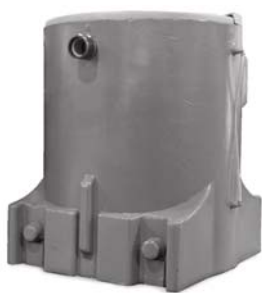
Polyethylene reservoir with insulation

The standard patented reservoir is a one-piece seamless design, rotationally molded from linear low density polyethylene and insulated with 3/8" dense foam insulation. The rectangular base accepts straight-line pump connections. The cylindrical shape adds structural strength. A tank baffle provides true 'hot-cold' operation. The standard service cover has cut-outs for distribution piping and an inspection opening. The tank volume is adequate to support expansion to 2 times its original chiller capacity (adding APT-RC or WPT chilling module and additional pumps).