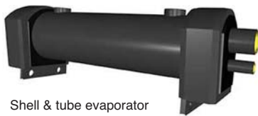
Shell & tube evaporator

Shell & tube evaporators are used on larger capacity systems. Refrigerant is circulated through copper tubes within the carbon steel shell to cool the process fluid that surrounds the tubes. Shell & tube evaporators are fully insulated and provide flexible, efficient heat transfer.