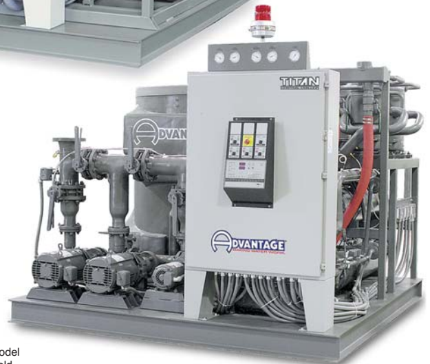
TI-60W shown. 60 ton water-cooled model with optional standby pump and manifold.