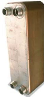
Brazed plate evaporator

Brazed plate evaporators are made of stainless steel plates brazed together with copper brazing material. This design promotes turbulent flow and high heat transfer rates in a compact, non-ferrous package. A cleanable basket strainer filter is included to protect the brazed plate evaporator from water born contamination.